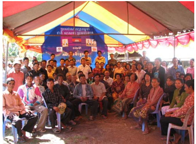
Field day activities

On December 26, 2007, Srer Khmer staff organized field day with the involvement 137 of participants (30 beneficiaries were direct beneficiaries) who from three villages were: Prek Taven, Chuark and Cham Puev Waon village. Field day aimed at promoting the awareness on project progress to direct and indirect beneficiaries to understand on the project activities. Especially, better understanding on sustainable agriculture.