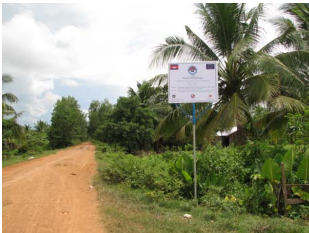
Project Sigh Board

On August 29, 2007, Srer Khmer placed sign board referring to equipment, materials with the logo of ECOSORN. Sign board placed in front village leader's house. According to TOR, Srer khmer discussed with ECOSORN to develop one sign board which has title of project and logo of counterparts.