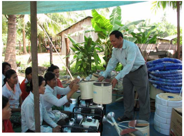
Farming kits Distribution

On September 25, 2007, Srer Khmer has provided farmers kits individual, knife, hoe, water sprayer, handled basket, Pumping machine and vegetable seeds to 30 beneficiaries in Prek Taven village. Providing farmer kits granted by Mr. Nu Shytearn ( vice-chief of district ). According to TNA reported that most of farmers have pumped water from canal and underground water for their cultivation. So what they need for improving their farm is pumping machine to irrigate their farms. It is interested to not that pumping machine is not in the TOR but due to need of their group, Srer Khmer discussed of ECOSORN to add this equipment in to the kit.