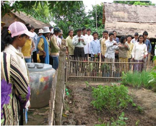
Exchange visit activities

On September 13, 2007, Srer Khmer has organized exchange visit for 30 beneficiaries in Sam Bok Ork and Wat Kandal village where Located in Sagnkae district which is the area where Srer Khmer is implementing on integrated farming activities with funding support from Food Security Initiative Fund (FSIF-CIDA). One of ECOSORN staff also attended this exchange visit. What beneficiaries learn from exchange visit were: