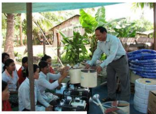
Farming kits Distribution